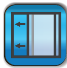
Auto Door Closer