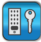
Digital / Keyed Lock